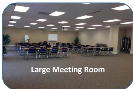
Large Meeting Room

Leading Providers | Innovative Approach | Personalized Care