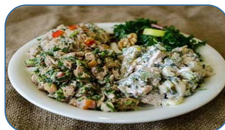
Patti's Café www.pattiscafe.com