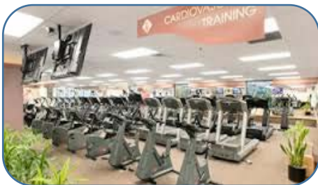
Healthtrax Fitness & Wellness www.healthtrax.com

You may work with any of our providers during your event, such as the following